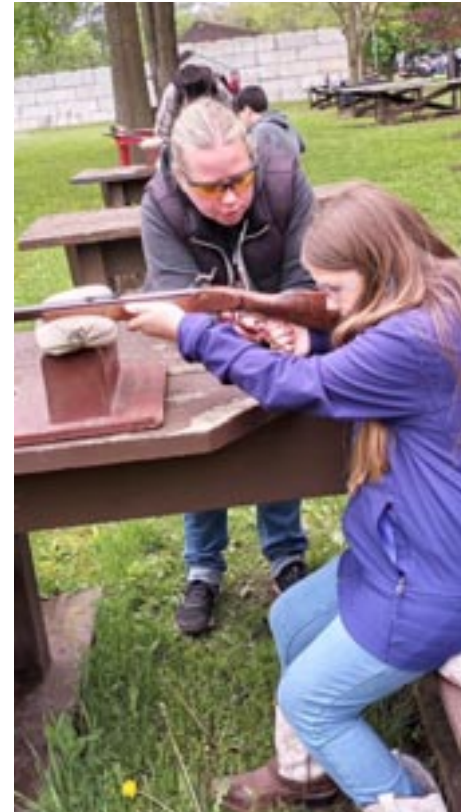
Volunteers at a recent Oscar Mike Clinic at Beloit Rifle Club.