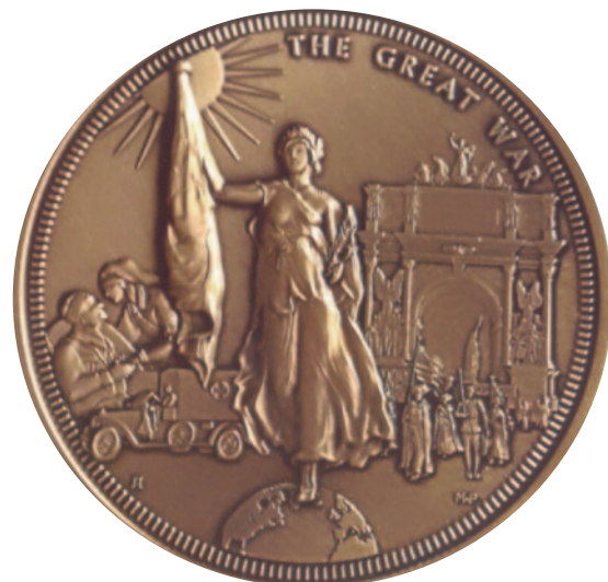
Sergeant York Medal front and back