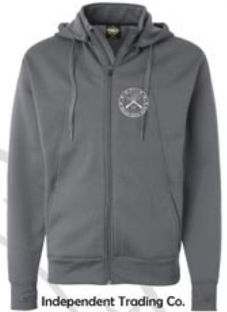
Independent Trading Co. EXP80PTZ Poly-Tech Full-Zip Hooded Sweatshirt $50.00 + Tax (s-xl)