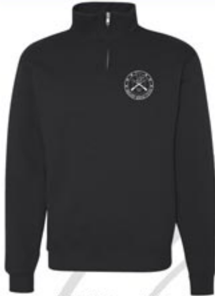
JERZEES - 995MR Cadet Collar Quarter-Zip Sweatshirt $34.00 + Tax (s-xl)