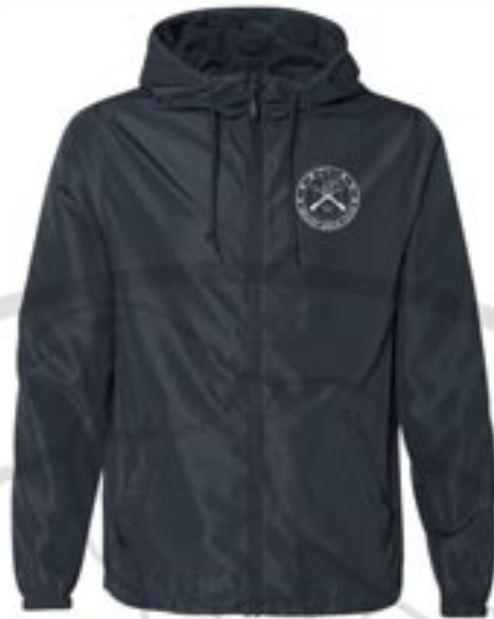
Independent Trading Co. - EXP54LWZ Water-Resistant Lightweight Windbreaker $49.00 + Tax (s-xl)