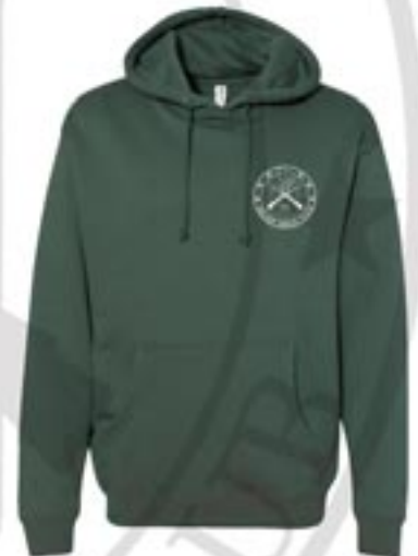
Independent Trading Co. IND4000 Hooded Sweatshirt $43.00 + Tax (s-xl)

(PLEASE NOTE SIZES ABOVE XL WILL BE $2-$3 EXTRA DEPENDING ON SIZE)