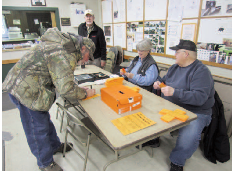
Check in and Raffle Tickets