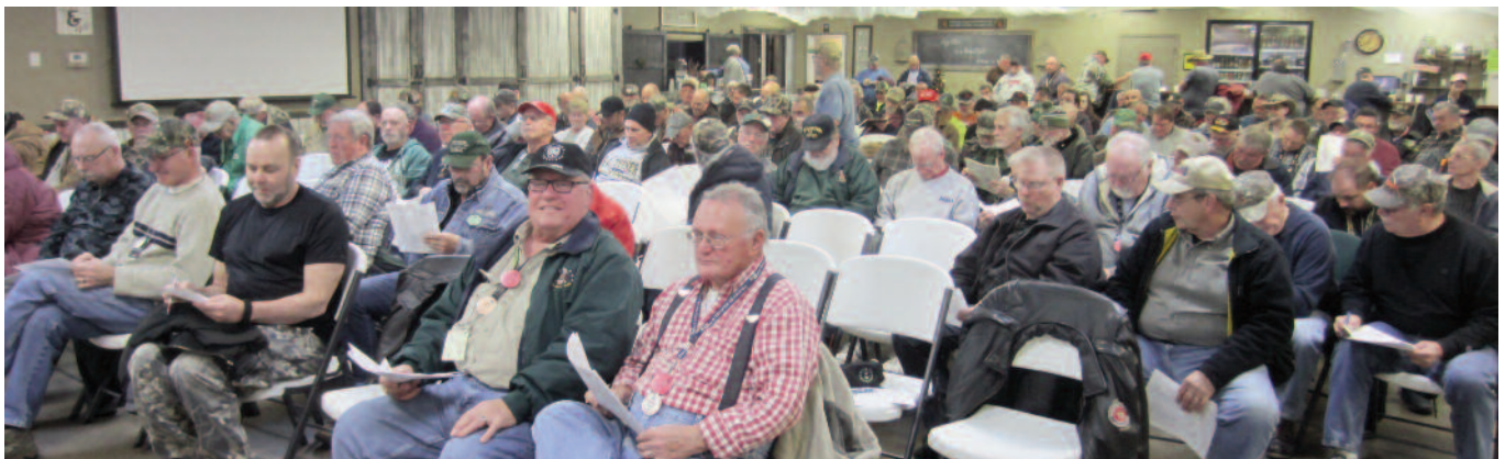
Those in attendance - 2019 Election