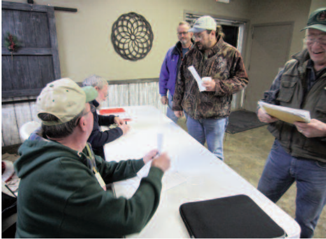
Signing in at Election Night.