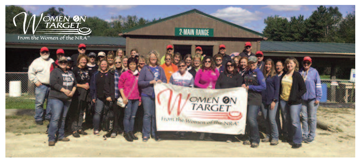
We hosted our 2nd annual Women on Target at the club on Sept 22. We had 31 ladies show up for the class. Learning firearm safety and handling, target shooting with .22 pistols and .22 rifles. It was a great day empowering women! Thank you to all who came out and all who volunteered! Looking forward to next year!